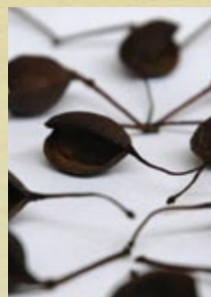
KATHY HOLOWKO BIG LITTLE THINGS A GARDEN IN COLLINGWOOD

Kathy Holowko welcomes you into her garden to share some of her observations and wonder for the natural world. Share her admiration for seeds, and empathy for the often invisible creatures that inhabit the garden. Through display and adjustments of scale, Holowko reveals some big little things.